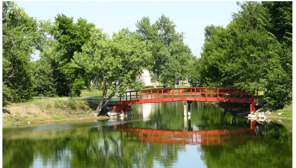
Figure 42: Plum Creek Park, Lexington