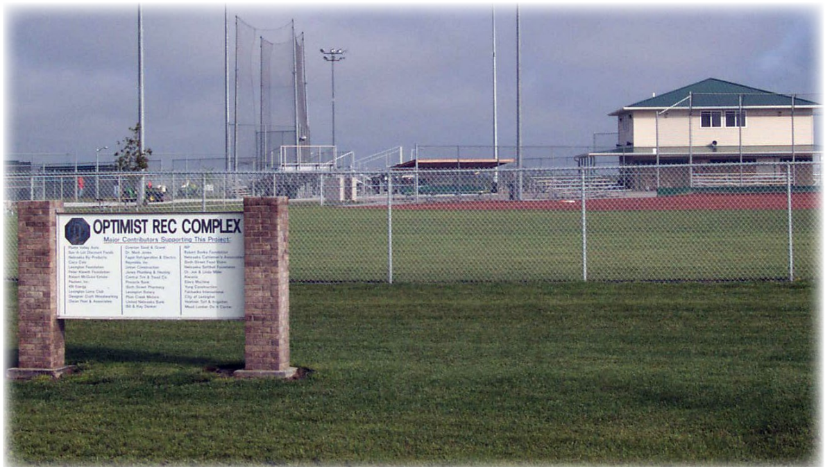
Figure 43: Optimist Recreational Complex, Lexington