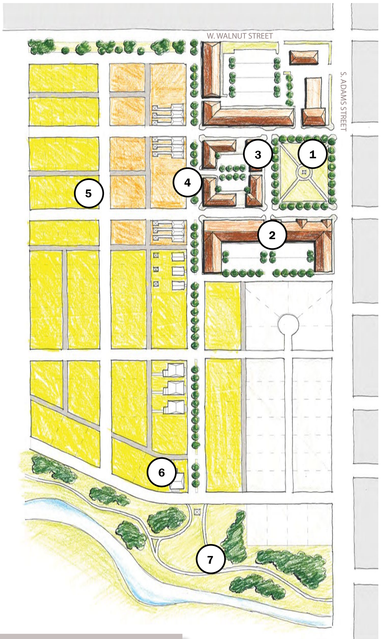
Figure 32: Southwest Neighborhood Design, Lexington