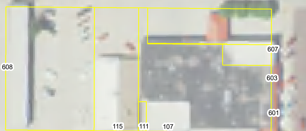
W 6TH ST