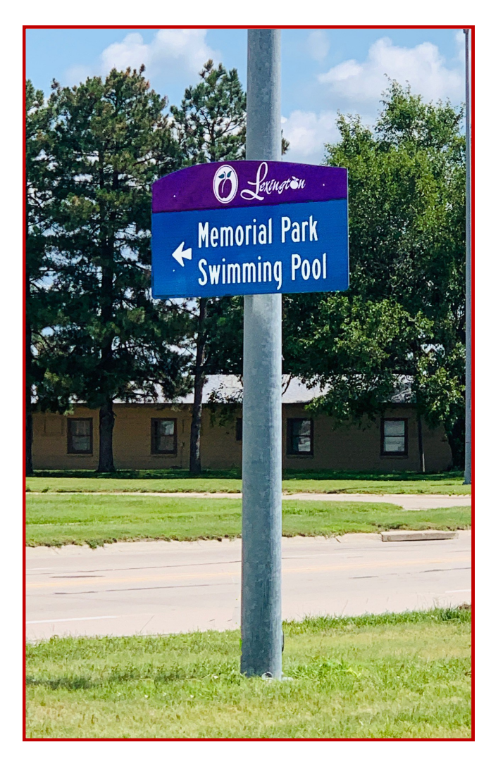
The first Wayfinding sign went up on eastbound Pacific Street (Highway 30), just west of Monroe Street.

Last but not least, most of the cost for the signs was funded by a grant from the Lexington Convention and Tourism Committee.