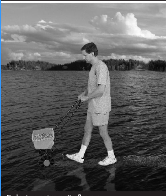
Find out more at www.cityoflex.com-