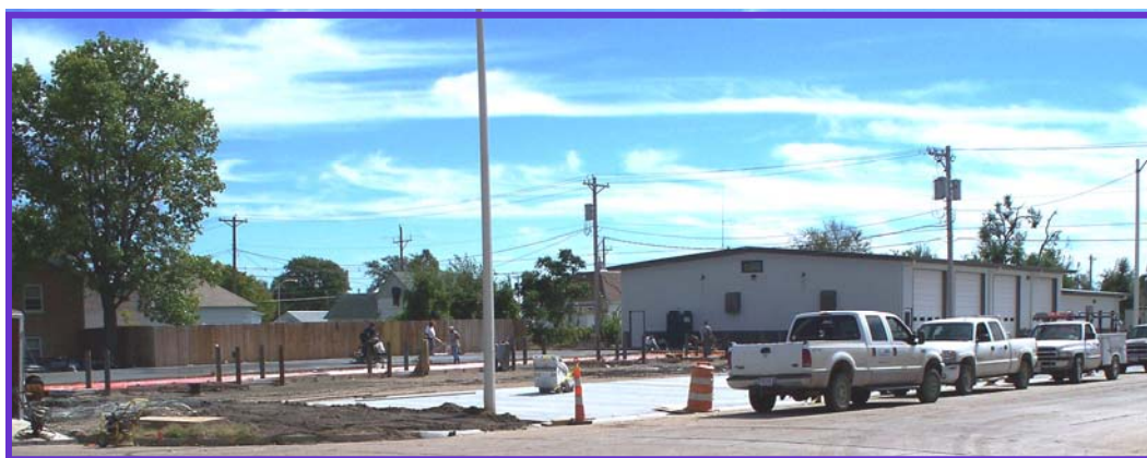
7th & Tyler: concrete floor finishing for new Fire Department building.