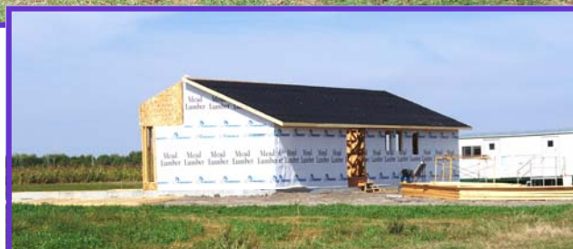
Right: ABLÉ house progress as of September 28.