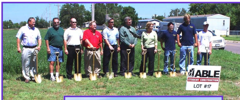
Above: August 13 groundbreaking ceremony for the ABLÉ student housing project

The first house in Lexington's new CED Addition is progressing nicely after the August 13 groundbreaking. Most of the first house will be built by high school students as practical experience for a construction curriculum. It is a collaborative project initiated by Dawson Area Development's ABLÉ program and Lexington Public Schools. Up to 21 more houses are planned for the first phase of building in this new residential neighborhood.