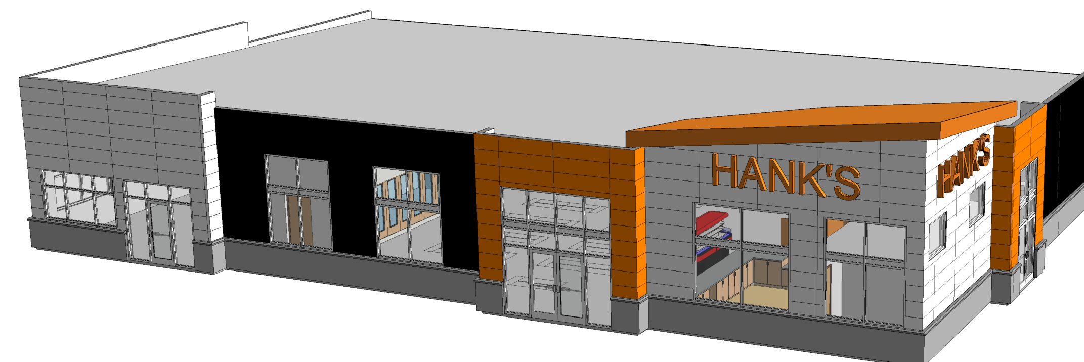
2 3D View 3