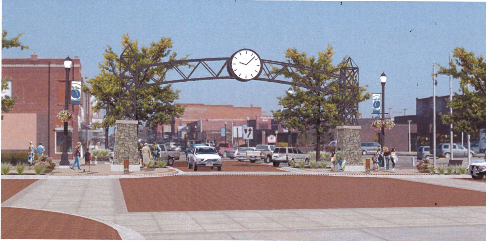
Figure 4.9: Gateway Entrance