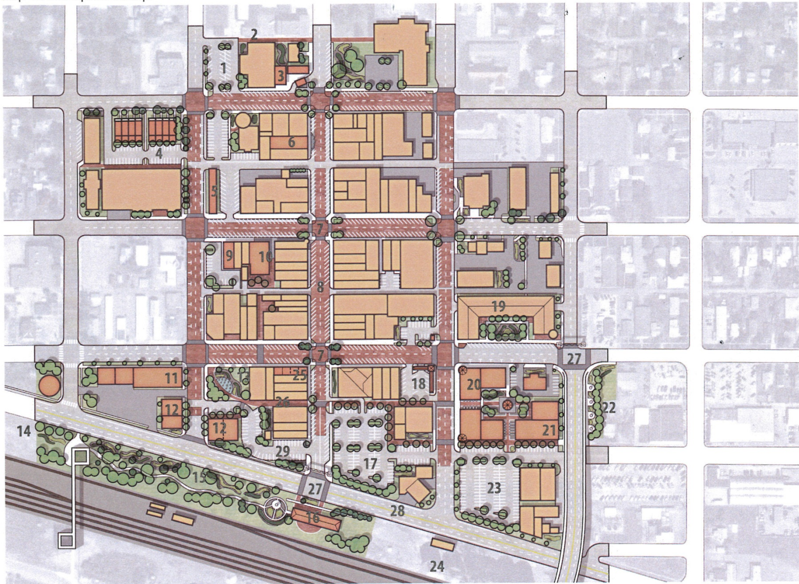
Map 4.1: Development Concept