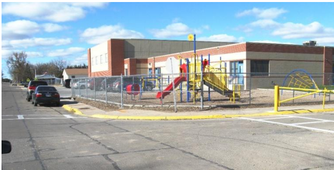
Adjacent Playground – Walnut & S Lincoln