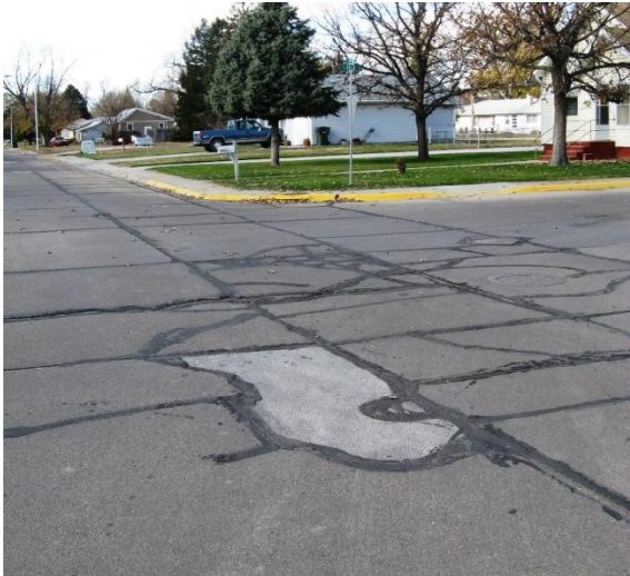
Lexington, Nebraska, 17th Street Photos – Nov. 10, 2010