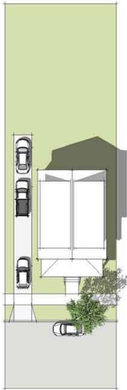
Lexington Infill Flex House