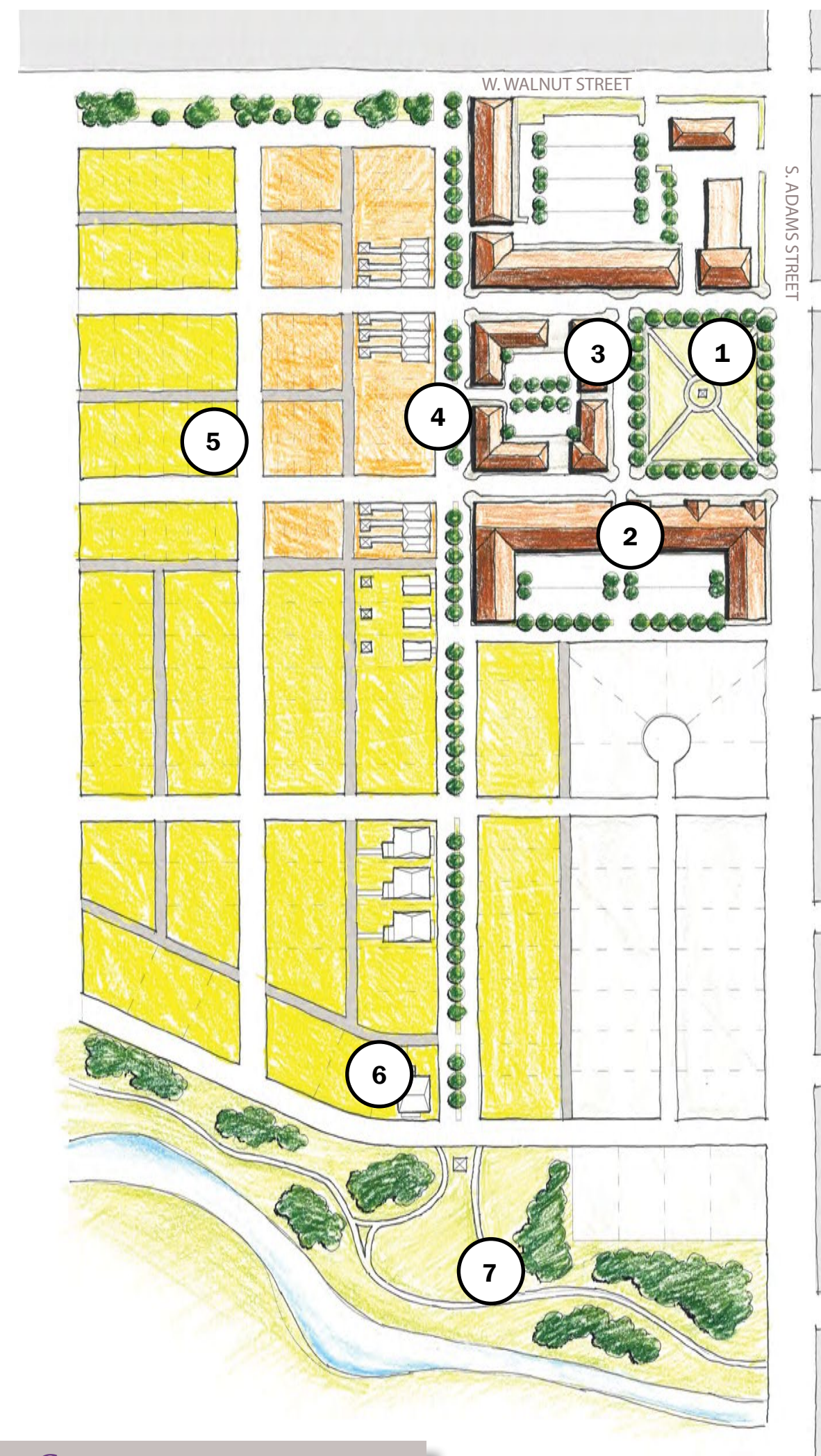
Figure 32: Southwest Neigborhood Design, Lexington