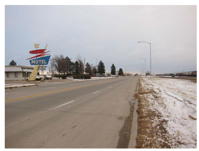
Existing Conditions along Highway 30

Reducing Highway 30 to three lanes provides more space for landscaping creating a safer and more beautiful front door into downtown Lexington