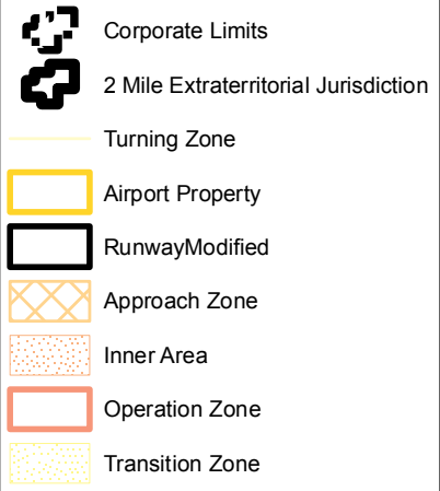
Figure 26: Jim Kelly Field Airport Overlay

City of Lexington Dawson County, Nebraska