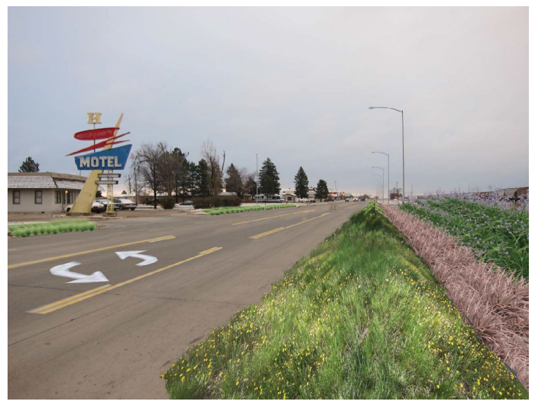
Proposed Improvements to Highway 30 F