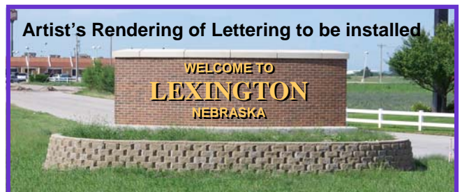
Artist's Rendering of Lettering to be installed

Work is nearly complete for a new Welcome to Lexington sign on the east side of Plum Creek Parkway, just to the north of the I-80 interstate exchange. The brick structure is about 20 x 6 feet, standing atop a three-foot retaining wall. The sign will have raised aluminum lettering, be lighted at night, and includes irrigation for the surrounding landscape. This City project was managed by six Lexington participants in the 2006-2007 Dawson Area Development Leadership program.