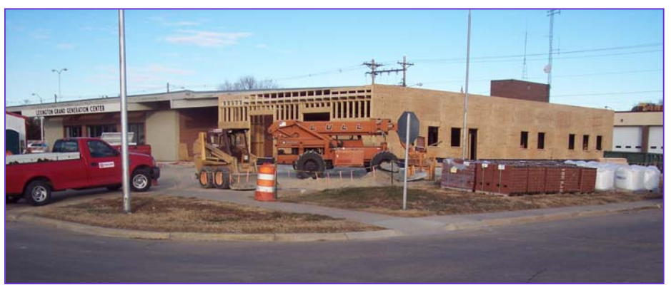
Grand Generation Center expansion progress as of December 1, 2006

work reconstructing 39 intersections to "handicap" ramps. About a third of the corners have been converted. The project will be completed in the spring when warmer weather permits.