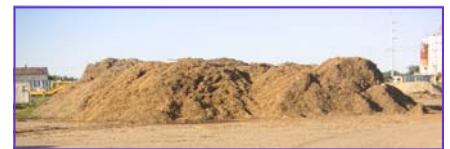
Come and get your chips: the wood chips are made from branches collected over the summer.