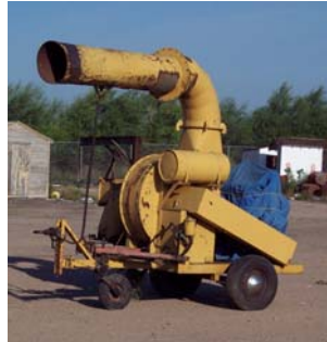
The City is retiring its 37-year-old leaf collecting machine.