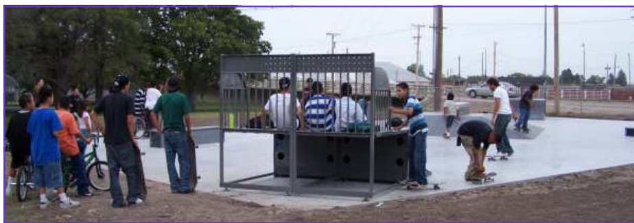
Lexington's new Skate Park location in Arbor Park . There is now a sidewalk where the youth are gathered at the left of the skate pad.

Creation of a new skateboard pad at the southeast corner of Arbor Park (near Maple & Plum Creek Pkwy) is complete. The concrete is in and skateboard equipment was moved from the old skate park at Oak Park. The City added a sidewalk and will soon plant grass seed around the new concrete. Future plans include upgraded lighting and possible addition of new hardware. The Lexington Community Foundation contributed funds toward the hardware fixtures. Local skateboard enthusiasts helped design the park layout.