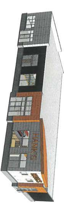
2 3D View 3