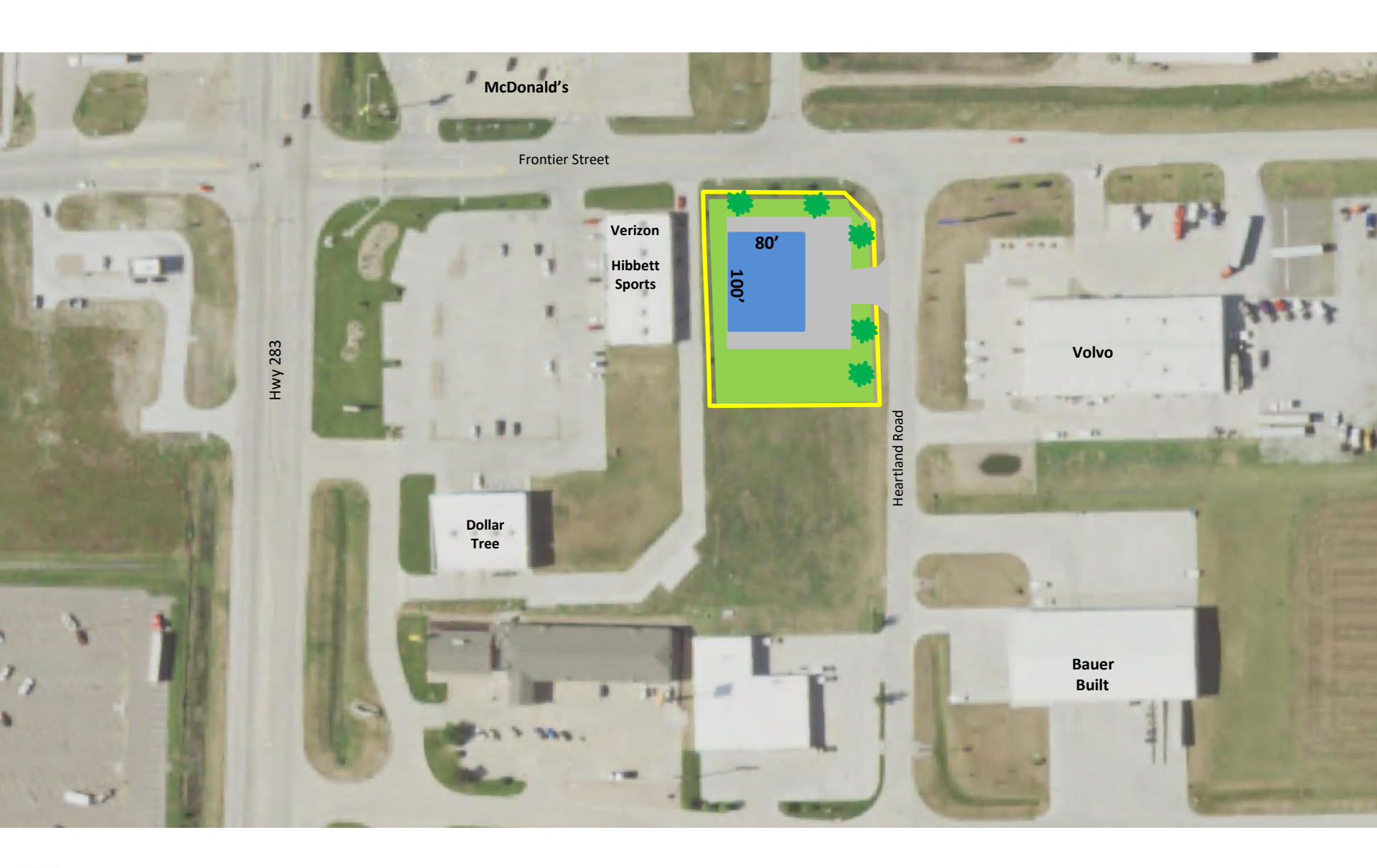
Exhibit B2 ServiceMaster Redevelopment Project—Lexington, NE