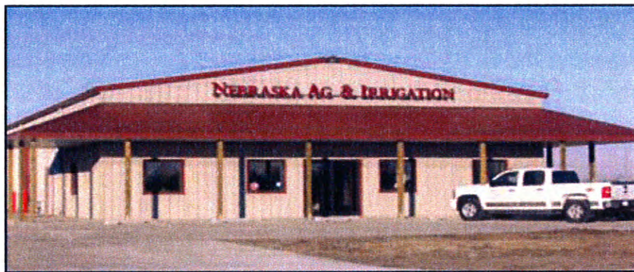
Nebraska Ag & Irrigation is located at 609 S. Meridian on the strip in Cozad.