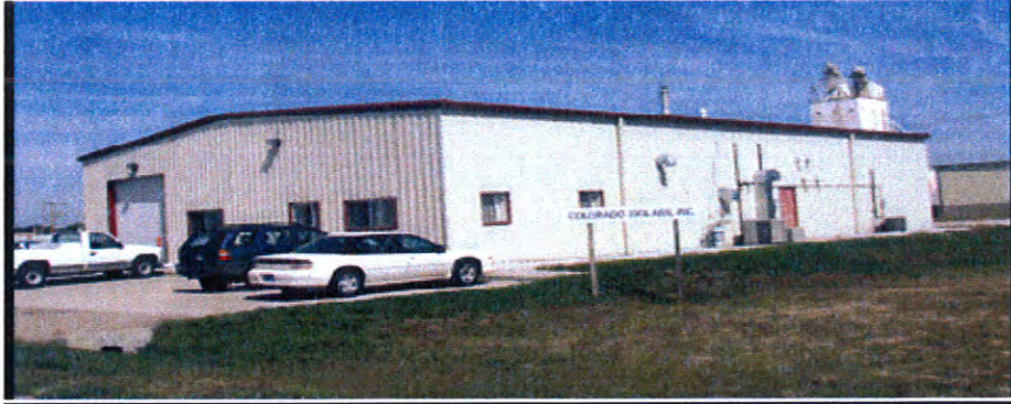
Colorado Biolabs, Cozad CDBG Reuse Loan Guarantee and Direct Loan