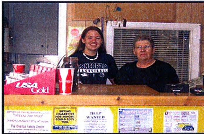
J&L Sinclair, Overton CDBG Reuse Direct Loan

DAD is set up as a Non-Profit Development Organization through the Nebraska Department of Economic Development. The DAD Board serves as the ultimate decision makers for loans that are made through the NDO. The Board consists of City managers/Administrators, Board members of local banks, County Economic Development Group representatives, local Attorneys, and members appointed at large to represent the area. Local Loan committees are utilized as well to make recommendations to the DAD board on CDBG reuse loan requests.