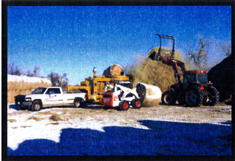
Messersmith Hay Company, Cozad: CDBG Reuse Loan Guarantee

DAD has been involved in the Administration of Several CDBG Reuse Loans over the past 10 years Including: